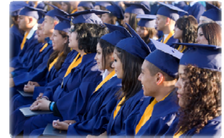
Enrollment Growth (Financed Schools Only)