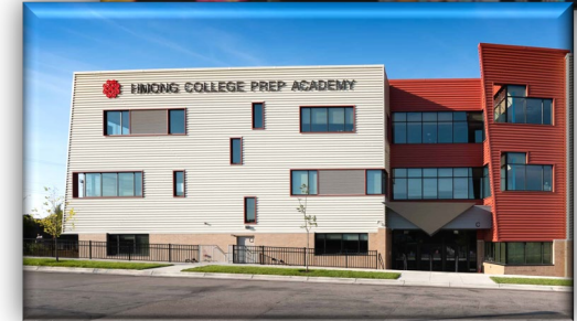
Enrollment as of Bond Financings