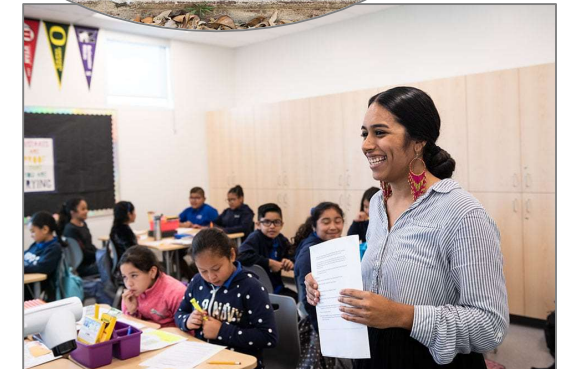
Related Schools Enrollment