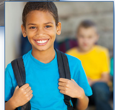
Enrollment of Pledged Schools